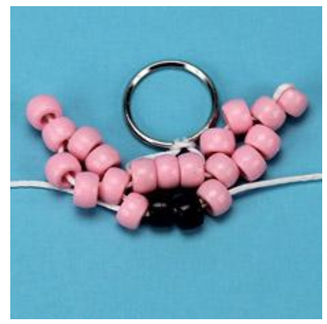
Step 13. To create Row 2, thread the following through the left hand string: (1) pink, (2) black and (1) pink bead. The black beads shown here are

the Bunny's eyes. Repeat steps 5 and 6 to create Row 2.