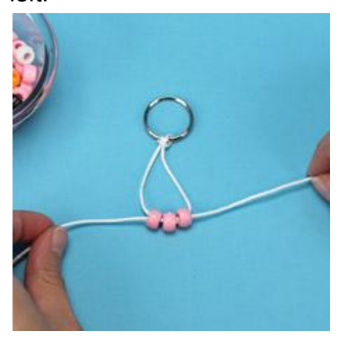
Step 6. Pull cords tight to form this row of your Bunny Bead Pet.

Take your right hand string and thread back through beads from the other end, from right to left.