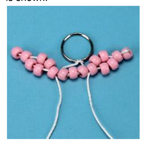
Step 12. Repeat steps 7-11 with the same bead pattern and technique for the right hand string. You should now have 2 bunny ears.