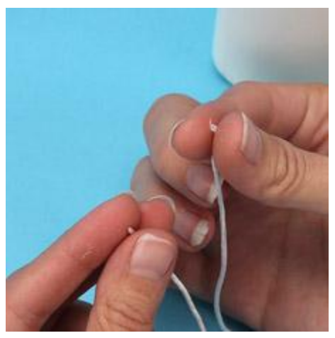
Step 2. Cut white Braiding Cord to 60 inches in length. Stiffen both ends by rolling it between your finger with a dab of craft glue. Allow glue to dry. This will help when threading the beads.