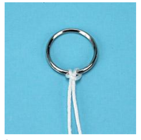
Step 3. Create a lark knot on the key ring. To learn how to create a lark knot, click here.