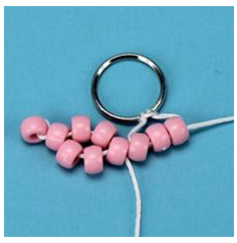
Step 11. Pull the cords tight to form the bunny ear that is shown.