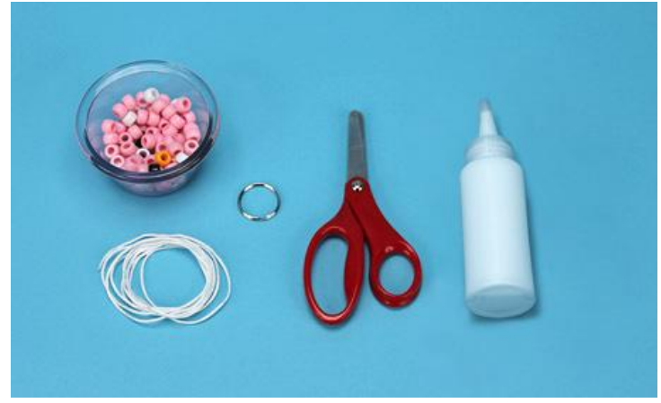
Step 1. Gather your supplies.