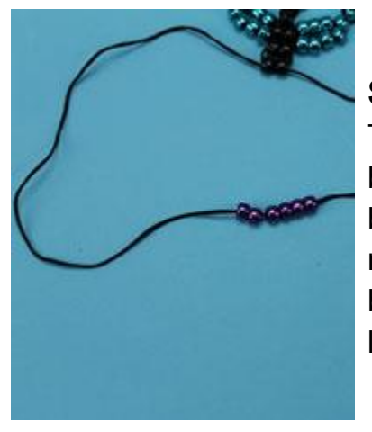
Step 13. To create the bottom wing of the butterfly, thread (6) metallic purple beads through the left hand string.