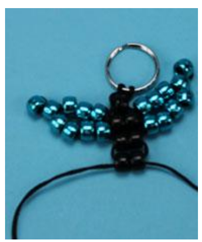
Step 12. Repeat Step 6 two times to create Rows 3 and 4 of the butterfly body.

Thread the end of the left hand string back through the second bead, from the left to the right, as shown.