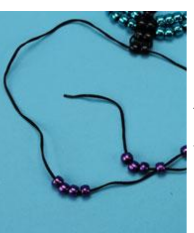
Step 15. Add (3) metallic purple beads through the left hand string.