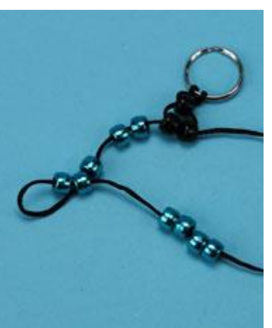
Step 9. Continue to create the wing by threading (4) metallic blue beads through the left hand string.

To create Row 2, thread (2) black beads through the left hand string. Repeat Steps 4 and 5 to complete the row.