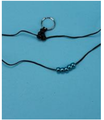
Step 7. To create one wing, thread (5) metallic blue beads through the left hand string.