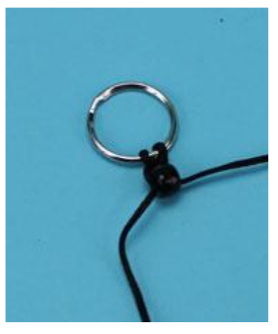
Step 5. Pull cords tight to form the first row of the Butterfly's body.