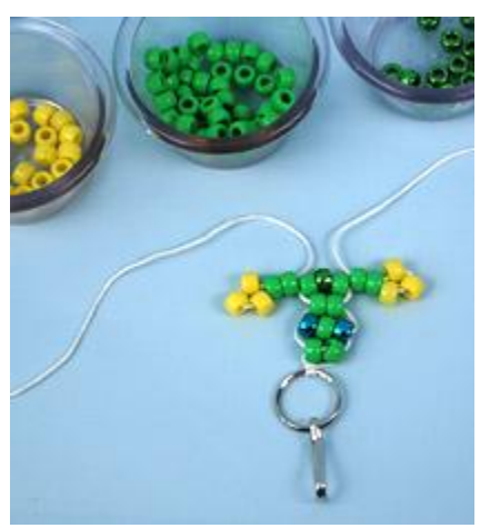
Step 14. Repeat Step 11 with the same bead pattern and technique for the right hand string.