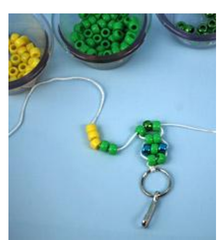
Step 11. To create the arms of the gecko, thread the following through the left hand string:(2) green, (3) yellow beads.