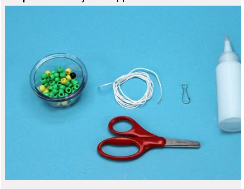
Step 1. Gather your supplies.