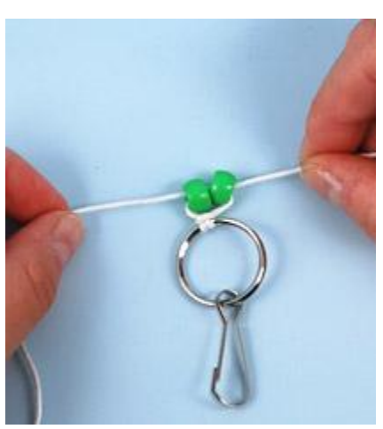
Step 6. Pull cords tight to form this row of your Gecko Bead Pet.