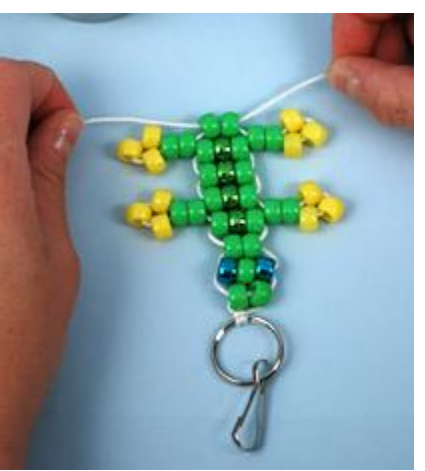
Step 17. To create Row 8, thread (2) green beads and repeat Steps 5 and 6 to complete row.