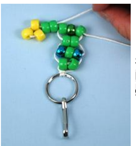
Step 13. Pull tight to form the gecko's arm.