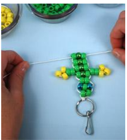
Step 15. Repeat the pattern created in Step 10 for Rows 5, 6 and 7.