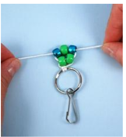
Step 8. Repeat Steps 5 and 6 to create Row 2. The blue beads here are the Gecko's eyes.