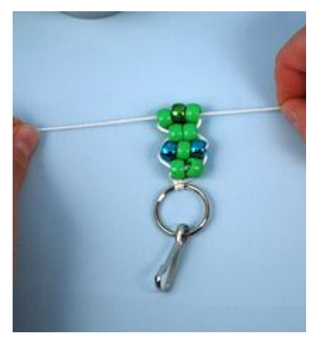
Step 10. To create Row 4, thread the following through the left hand string: (1) green, (1) Metallic green, (1) green bead. Repeat Steps 5 and 6 to complete row.