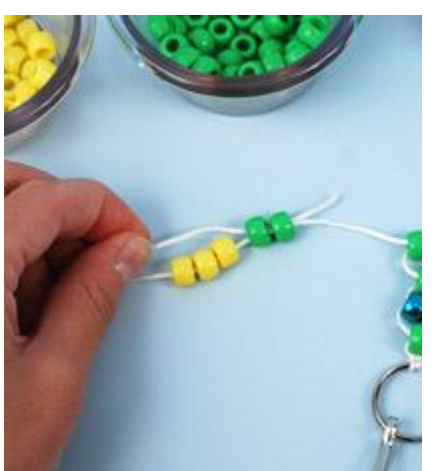
Step 12. Take the end of the left hand string and thread it back through the 2 green beads.