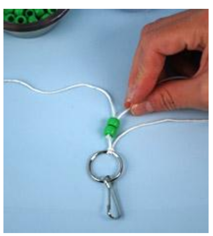
Step 5. Take your right hand string and lace back through beads from the other end.