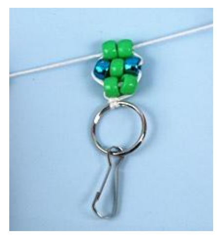
Step 9. To create Row 3, thread (2) green beads through the left hand string: Repeat steps 5 and 6 to complete row.