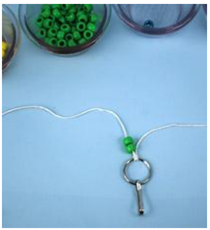
Step 4. To create Row 1, thread (2) green Pony Beads onto the left hand string