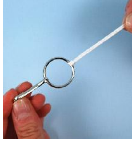
Step 3. Create a lark knot on the key ring.