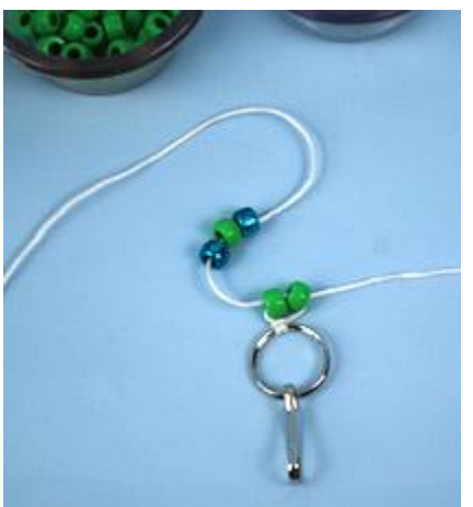
Step 7. To create Row 2, thread the following through the left hand string: (1) metallic blue, (1) green, and (1) metallic blue bead.