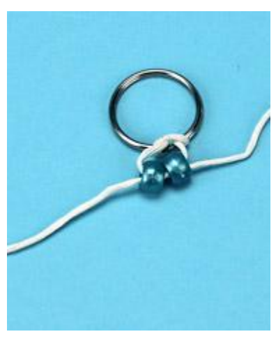
Step 6. Pull cords tight to form this row of your Turtle Bead Pet.