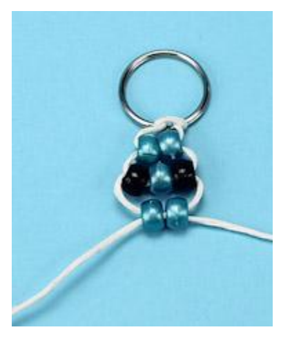
Step 9. To create Row 3, thread the following through the left hand string: (2) blue beads. Repeat Steps 5 and 6 to complete row.