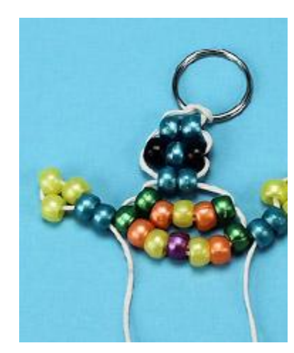
Step 14. Repeat Step 12 with the same bead pattern and technique for the right hand string, thread only from right to left. You should now have 2 arms on your Turtle