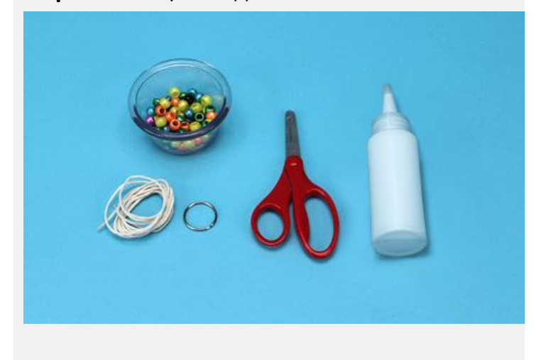
Step 1. Gather your supplies.