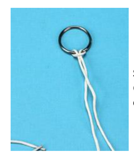
Step 3. Create a lark knot on the key ring.