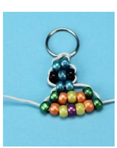
To create Row 5, thread the following through the left hand string: (1) green, (1) orange, (1) yellow, (1) purple, (1) yellow, (1) orange and (1)