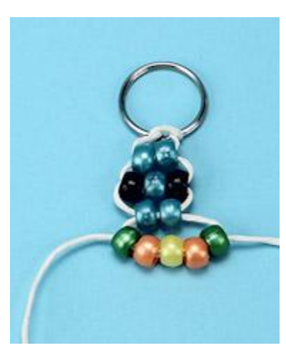
To create Row 4, thread the following through the left hand string: (1) green, (1) orange, (1) yellow, (1) orange and (1) green bead. Repeat Steps 5 and 6 to complete row. This row will be the top of the turtle's shell.