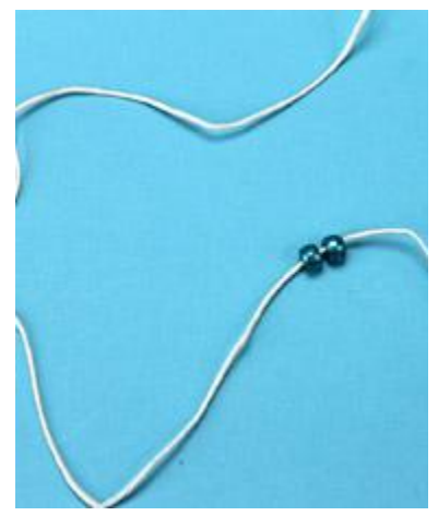
Step 4. To create Row 1, thread (2) blue Pony Beads onto the left hand string.

Cut white Braiding Cord to 60 inches in length. Stiffen both ends by rolling it between your finger with a dab of craft glue. Allow glue to dry. This will help when threading the beads.