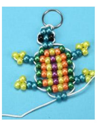
Step 18. To create Row 10, thread the following through the left hand string: (2) blue beads. Repeat Steps 5 and 6 to complete row.

Step 20. Tie the end of the cord to the ends of Row 10. Tie a double knot then trim excess cord. Your Turtle Bead Pet is now complete!