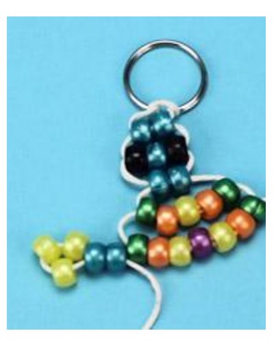
Step 13. Take the end of the same left hand string and thread it back through the first (2) blue beads, from left to right.