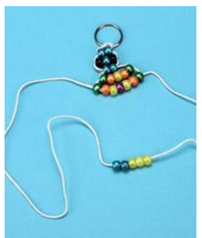
Step 12. You will now need to create the turtle's arms. Thread the following through the left hand string: (2) blue and (3) yellow beads.