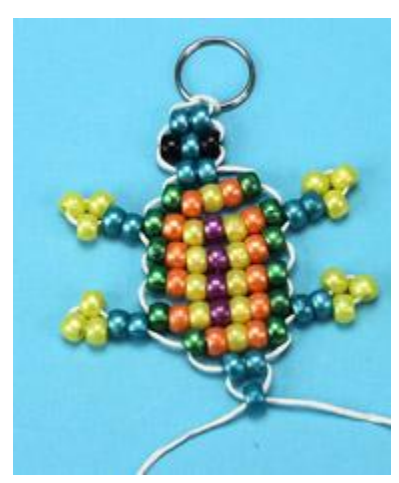
Step 19. To create Row 11, thread the following through the left hand string: (1) blue bead. Repeat Steps 5 and 6 to complete row. This is the turtle's tail.