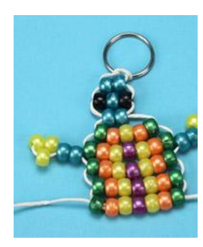
Step 15. To create Row 6, thread the following through the left hand string: (1) green, (1) orange, (1) yellow, (1) purple, (1) yellow, (1) orange and (1) green bead. Repeat Steps 5 and 6 to complete row. Repeat this pattern to also create Row 7 and 8.