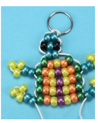
Step 16. To create the turtle's legs, repeat Steps 12 – 14.