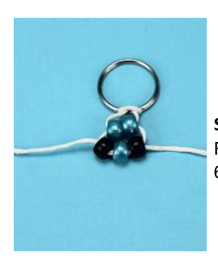
Step 8. Repeat Steps 5 and 6 to create Row 2.