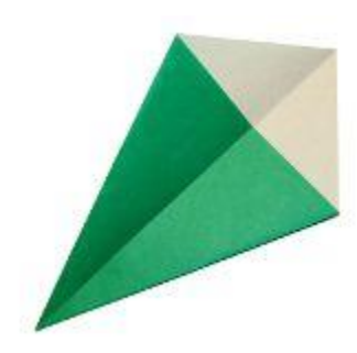
Step 12: Now fold the bottom edge to the center crease. It should resemble a kite like in this picture.

Click "Like" if you like the eas sunflower instructions.