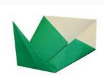
Step 14: Take a portion from the bottom and fold it up diagonally as you see in the picture.