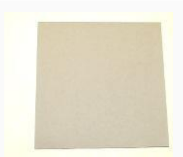
Step 9: Now to make the stem. Get a new piece of paper and place it color side down.