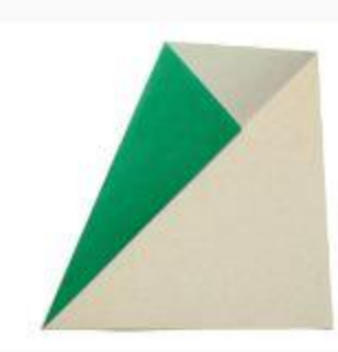
Step 11: Fold the left edge to the center crease.