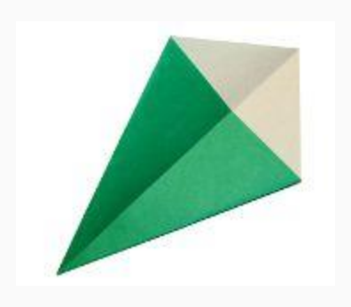
Step 12: Now fold the bottom edge to the center crease. It should resemble a kite like in this picture.