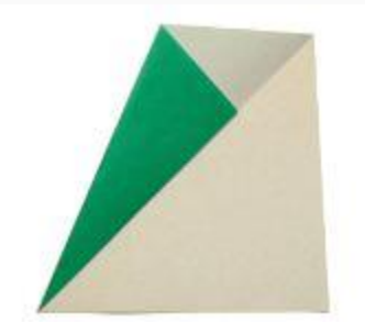
Step 11: Fold the left edge to the center crease.