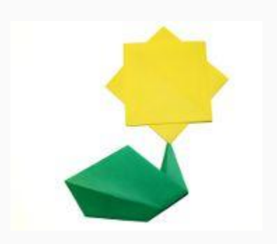
Step 16: Finally tape the sur Good job!