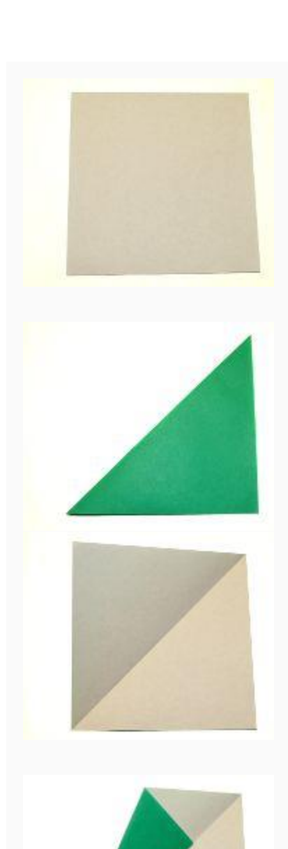
Step 9: Now to make the stem. Get a new piece of paper and place it color side down.