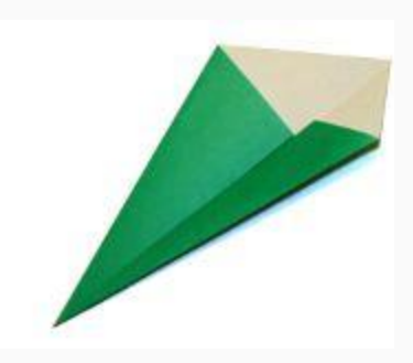
Step 13: Again, fold the bottom edge to the center crease.