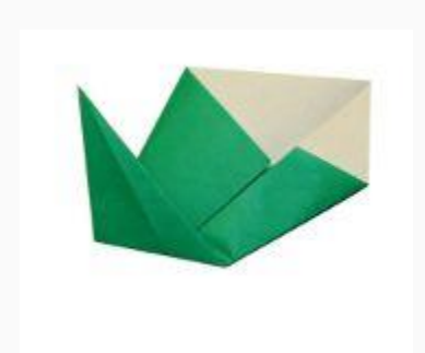
Step 14: Take a portion from the bottom and fold it up diagonally as you see in the picture.