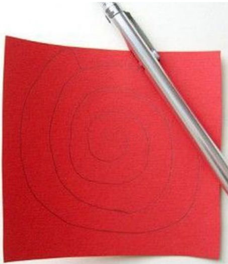
step 1: draw a spiral on a 4x4" square sheet of paper.