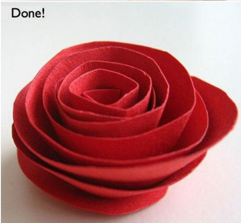
Step 4: glue spiral to base