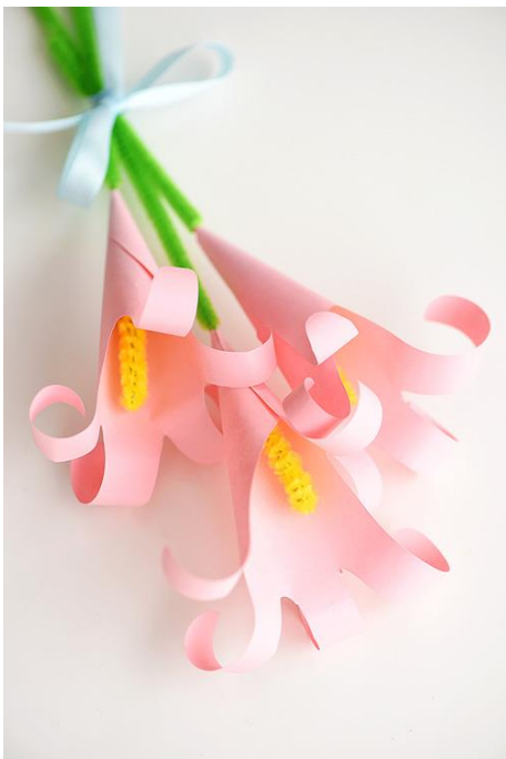
Hand Print Lily

Don't they look pretty? And they are so easy to make! Who would have thought!?