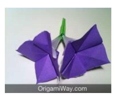
Step 15: Slide the other pair of prongs into the sides of another origami flower. Make more for a bouquet of hydrangeas!

Step 11: Once again, fold the top left and right edges to the center to make the top thinner.