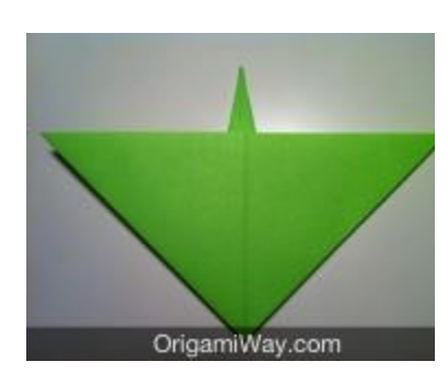
Step 12: Turn the figure over.